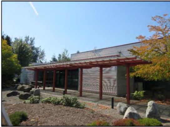
Front view of the subject building

*Note: The original Landscape Plan illustrated existing trees along the north property line. Only two of these trees exist today, both of which are proposed for retention.