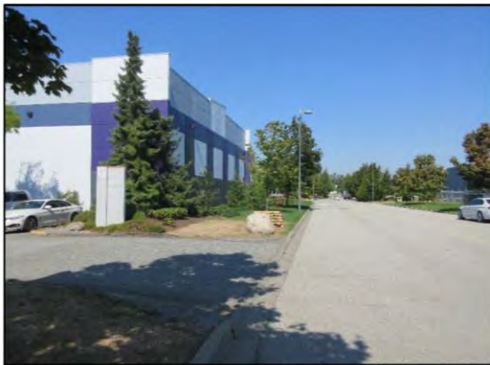
Looking north along 275 th Street within the immediate vicinity of the Property