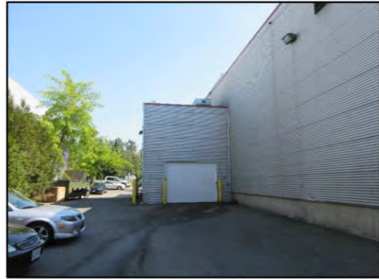
Side/rear view of the subject building