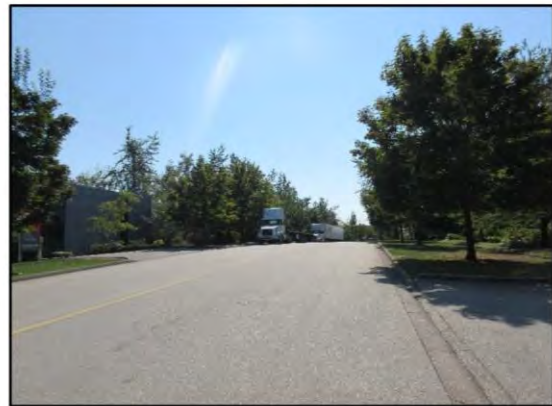
Looking south along 275 th Street within the immediate vicinity of the Property