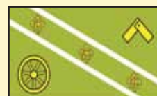
City of St. Thomas November 23rd, 2015