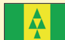
City of Prince Albert November 23rd, 2015