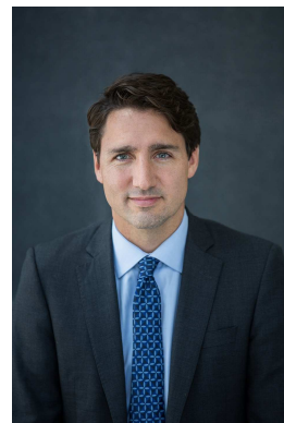
The Rt. Hon. Justin P.J. Trudeau, P.C., M.P. Prime Minister of Canada

A handwritten signature in blue ink, appearing to read 'Justin Trudeau', with a large, stylized flourish extending from the end.