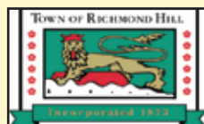
Town of Richmond Hill November 23rd, 2015