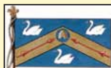
City of Stratford November 23rd, 2015