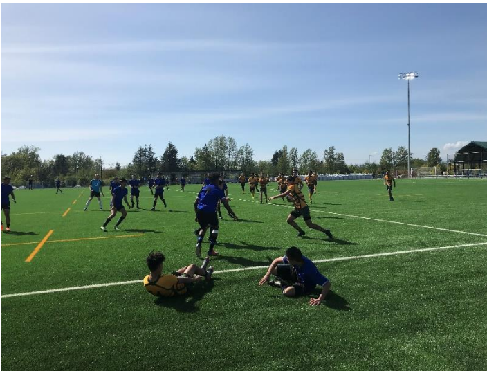
Willoughby Community Park